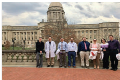
Residents from SEH