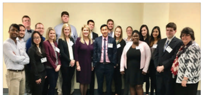
Medical Students from UK & UL